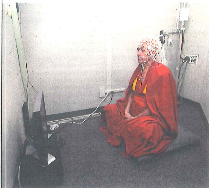
INNER PATHWAYS of brain activity register on an electroencephalogram as co-author Matthieu Ricard meditates.

normal daily irritants—an angry colleague at work, a worried child at home—become less disruptive, and a sense of psychological well-being develops.