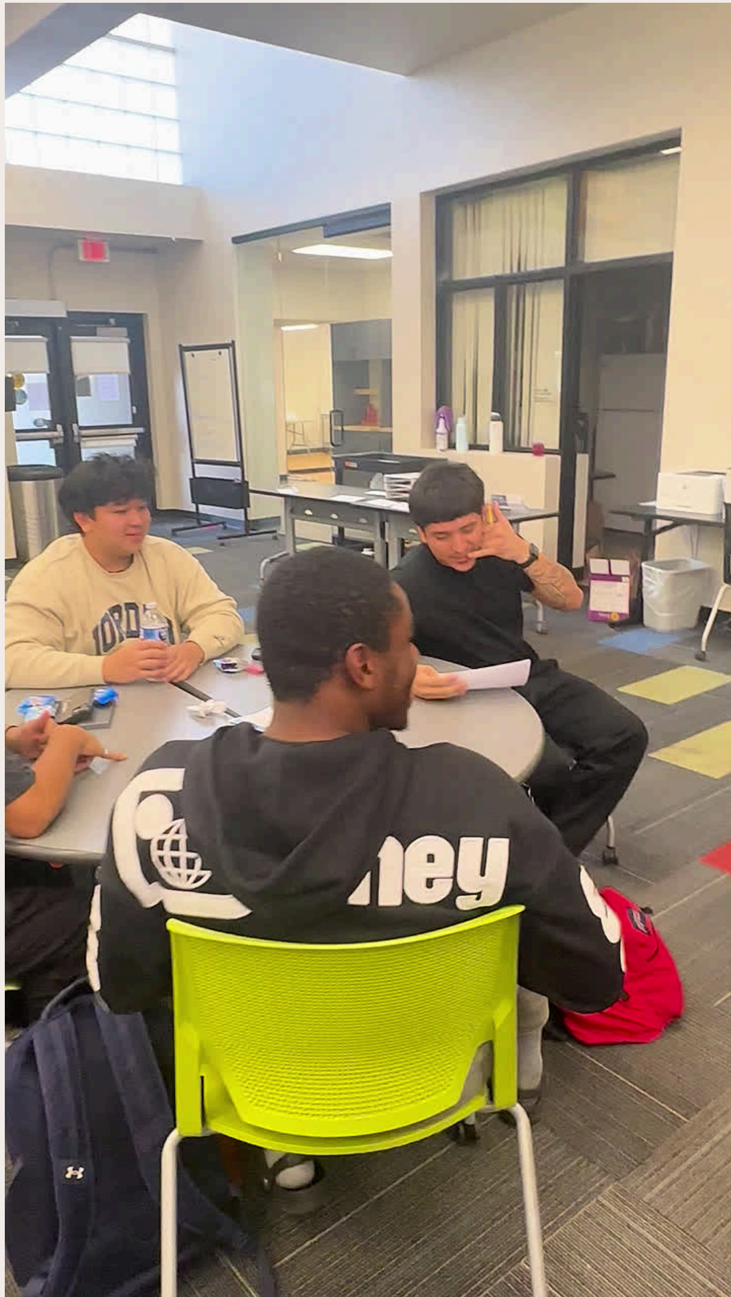
Pictured: Team working professional phone etiquette