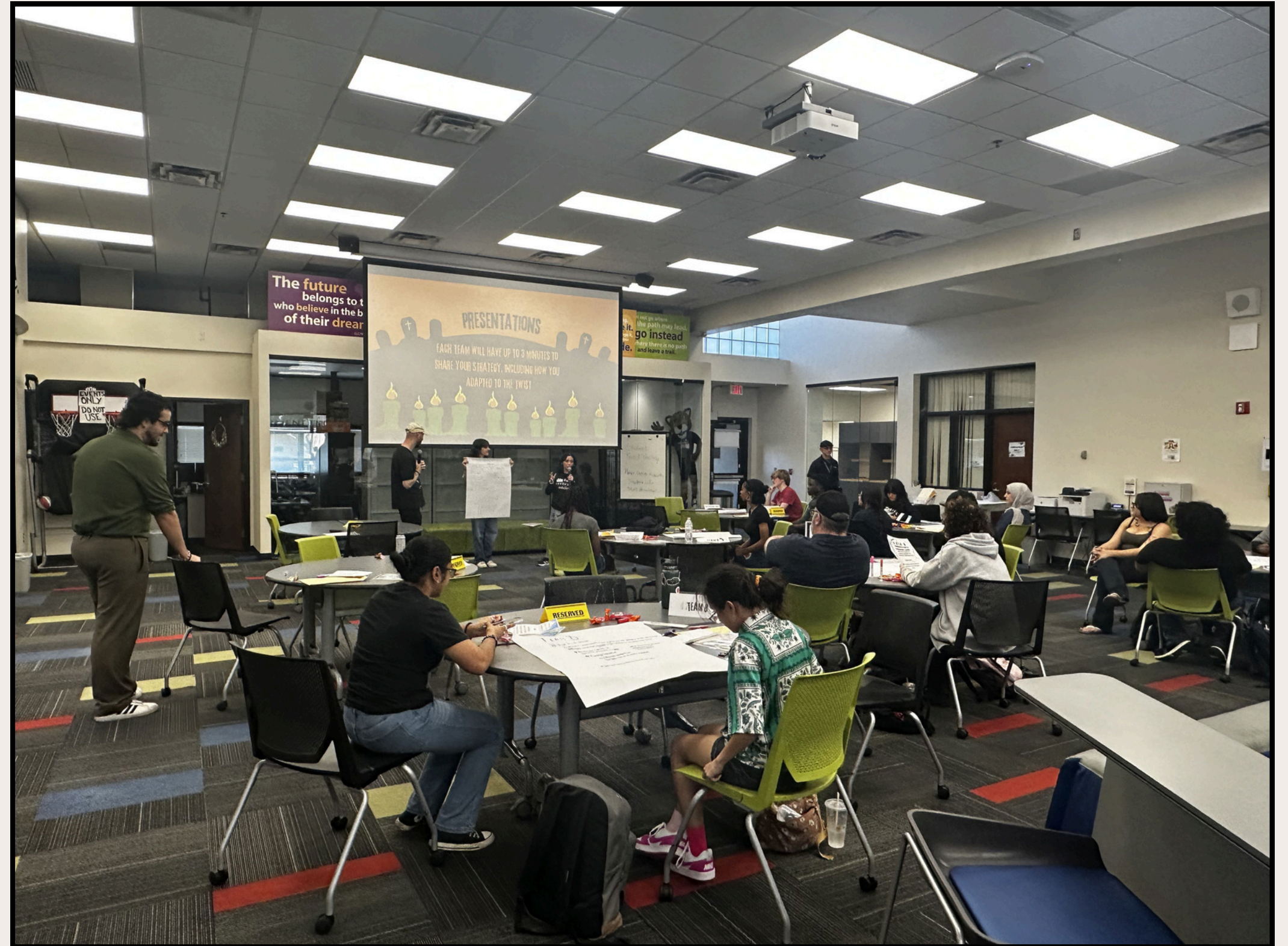
Pictured: Team Presentations