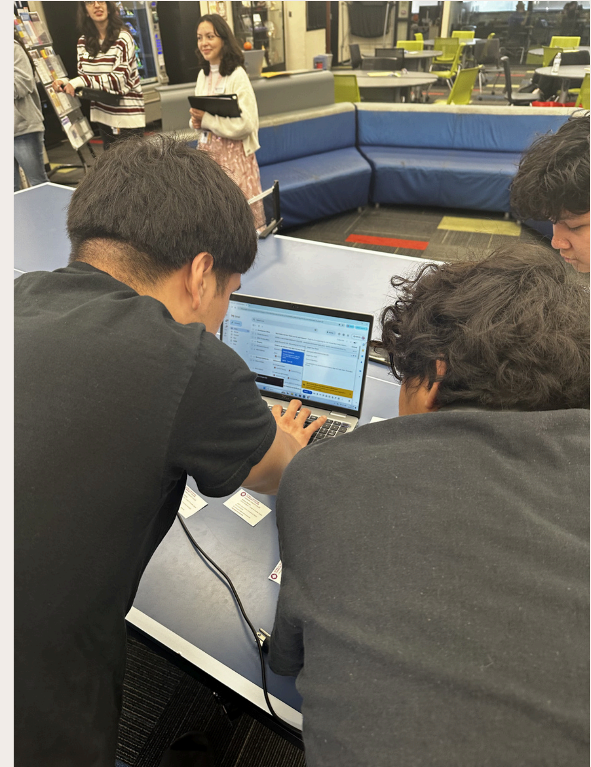
Pictured: Team working on sending a professional email