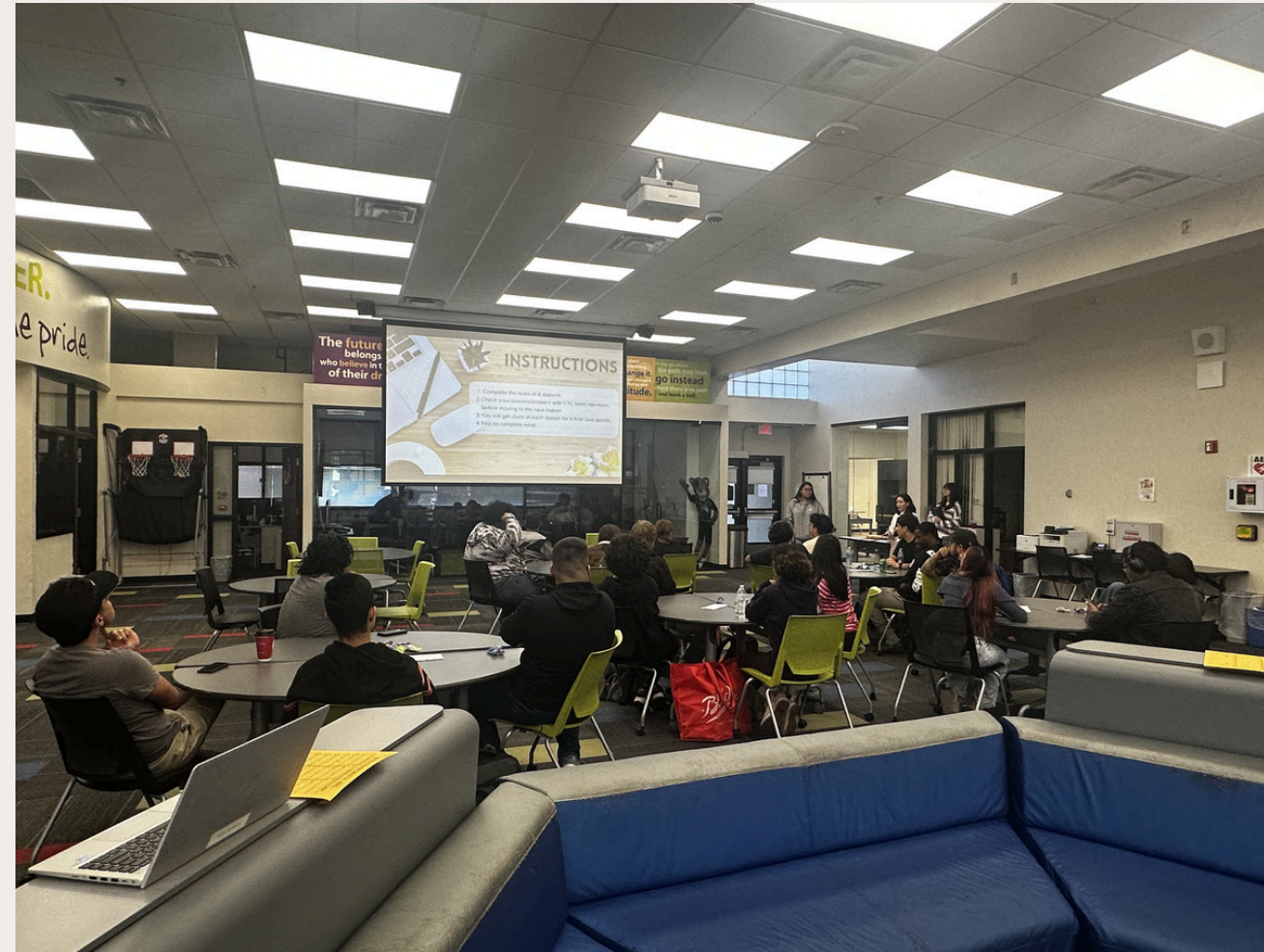
Pictured: Participants at second challenge